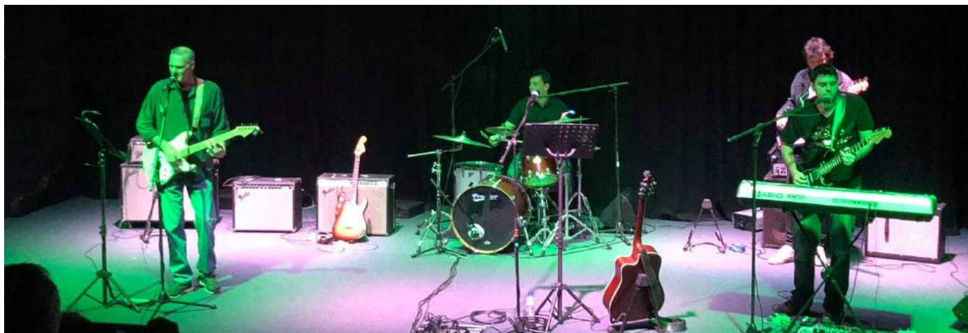
TOP: Local band Rum Jungle

What a wonderful night for our lighting and sound launch, thank you to our sponsors Bendigo Bank, Department of Racing and Gaming and Lotterywest. Thanks to all our members and friends who helped us celebrate!